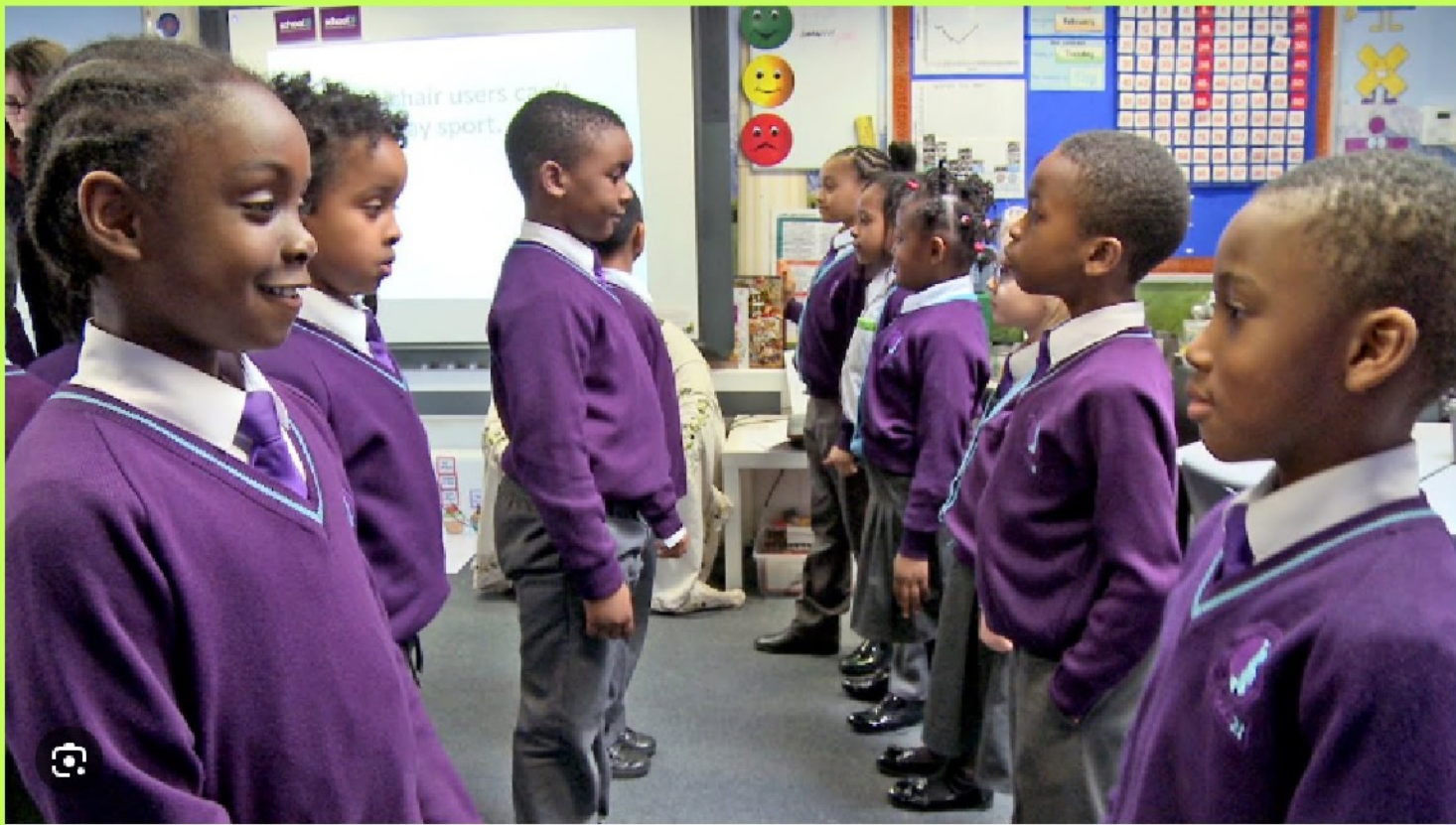
Oracy in the Classroom: Strategies for Effective Talk